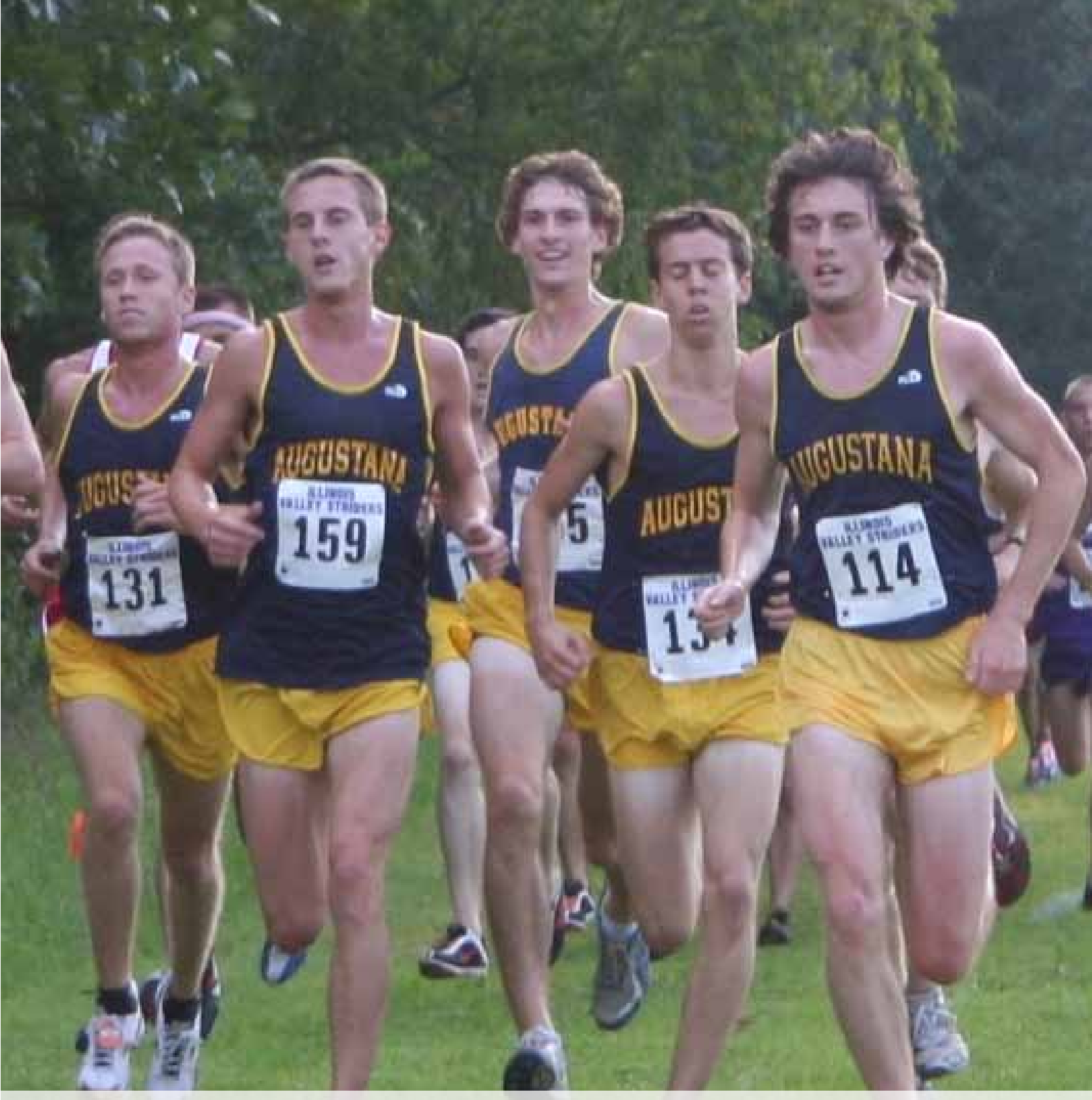
2010 Men's Cross Country Media Guide